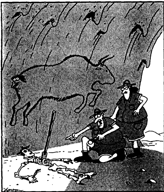
"Amazing! The mummified remains of a prehistoric cave-painter—still clutching his brush! ... Seems he made an enemy, though."