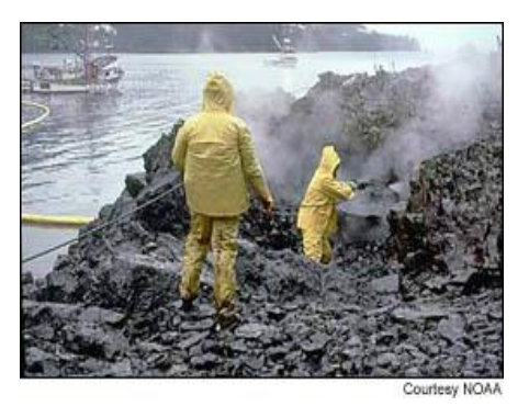
Marine Environmental Science Laboratory: ENV 115L