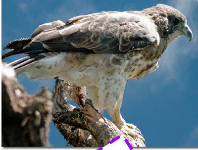
Endemic Hawaiian Hawk is only found on Hawaii. © 2009 Photo by Kanalu Chock. Licensed under Creative Commons Attribution 2.0 or later version. http://www.flickr.com/people/kanalu/