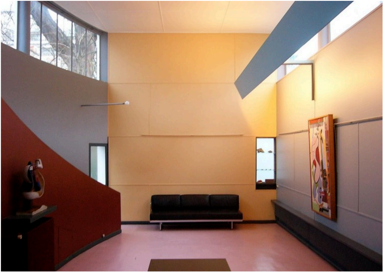
(Villa Roche by Le Corbusier, 1925)